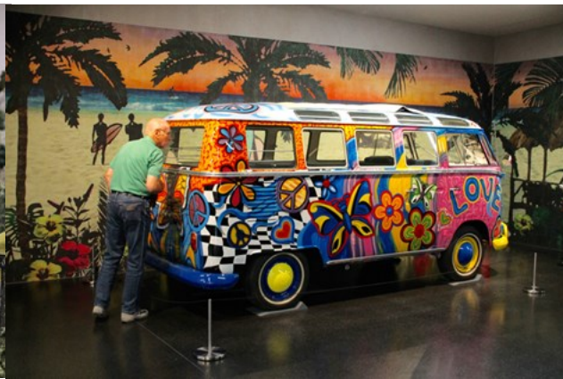
A real VW camper.