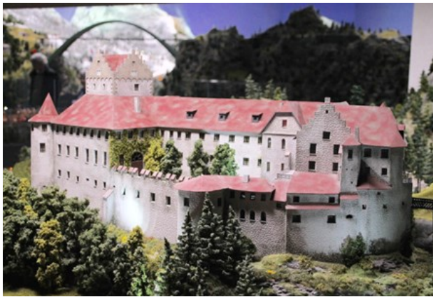
Fantastic model of the Meersburg castle.