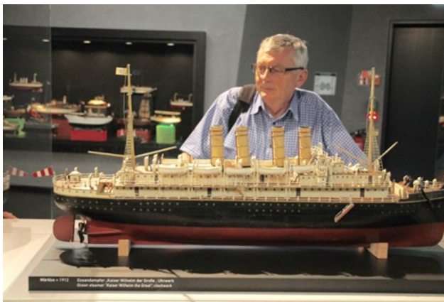
Wonderful ship models from Märklin.