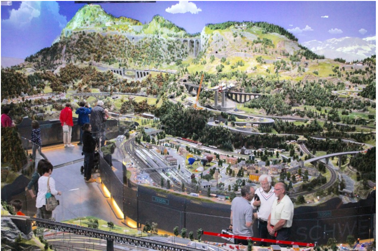
Mountains in the model train world are up to 4 meters high.

In the model train world, alpine regions of Bavaria, Austria and of Switzerland have been realistically recreated at 1/87 scale. Up to 40 of the 180 Märklin trains run simultaneously in this layout. Amazing sound and light effects recreate night and day and also thunderstorms and lightning. In addition, a number of cars (Faller car system) run in the layout.