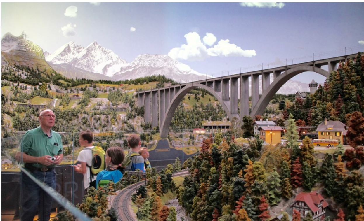
The 400 m2 model train layout, showing parts of Austria, Switzerland and Bavaria.

Hans-Peter Porsche is a collector of real cars, nostalgic metal toys and model trains. He exhibits his collection at the TraumWerk, a brand-new exhibition building of 5,500 m 2 on a park-like property of 250,000 m 2 . TraumWerk was opened only a year ago, on 21. June 2015. Most interesting to me was the 400 m 2 model train layout, the Modellbahnwelt (model train world). Very impressive is also the comprehensive metal toy collection that includes many historic Märklin toys. Real vintage cars from Porsche's collection are also on display.