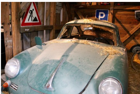
A real, somewhat neglected Porsche.